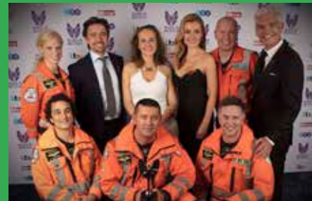
Winning a Pride of Britain award with the London's Air Ambulance team